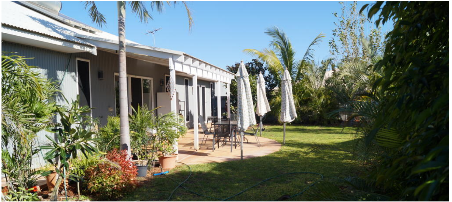
39 Snapper Loop, Exmouth